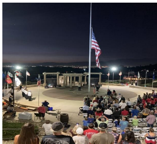
VETERANS MEMORIAL PLAZA