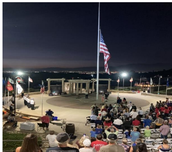
VETERANS MEMORIAL PLAZA 2022